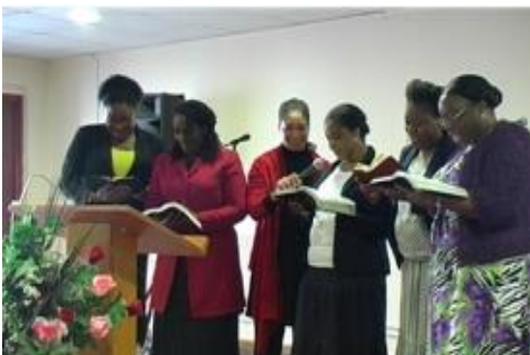
The Women's Ministry Team read Proverbs Chapter 31