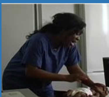
Sister Daddy gives a First Aid demonstration

Different modes of delivery (including common complications)